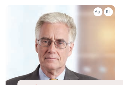
Lord Turner FRS Appointment: September 2015 Age: 62