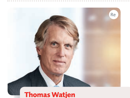
Appointment: July 2017 Age: 63