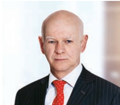
Sir Howard Davies